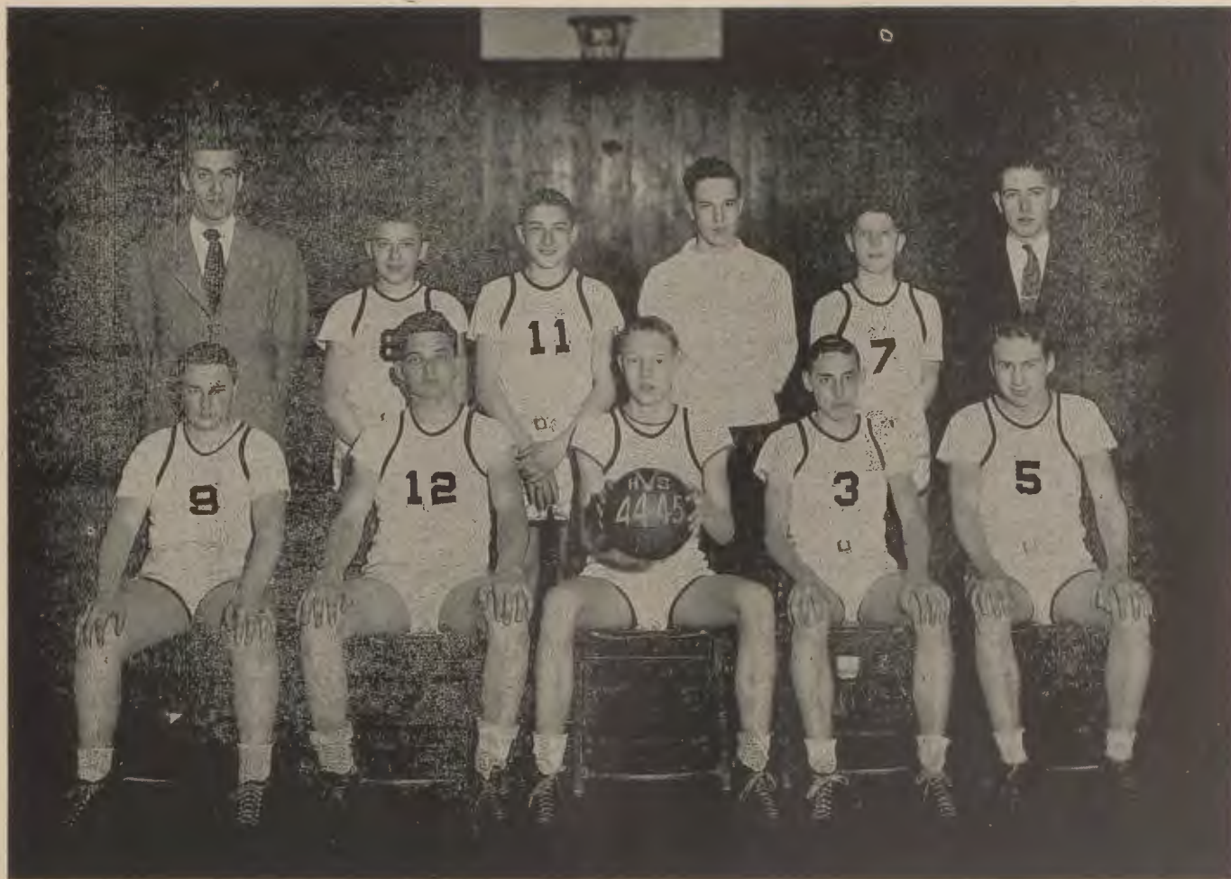
1945 BOYS' BASKETBALL TEAM