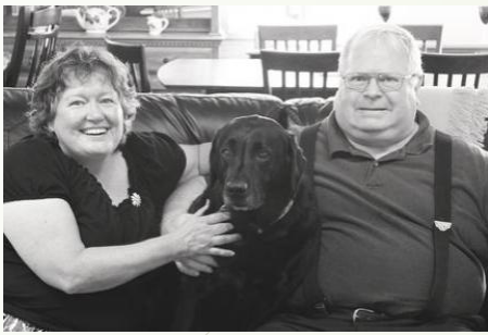
The Crosby Collection

For decades, post cards and photos have been ways to capture memories of places we have traveled and sites we have seen. From a historical perspective, they offer a window into how the Main Street developed over time. From the Crosby Collection, we offer you a look at postcards and print of the Vergennes Main Street and Otter Creek Basin circa 1890- 1950. This was compiled in summer 2022 with local historian Cookie Steponaitis.